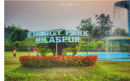
Solar Energy Park