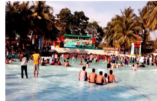
Water Bomb Waterpark