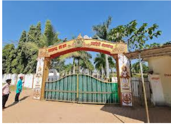
Crocodile Park, Masturi