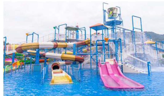
Bubble Island Waterpark