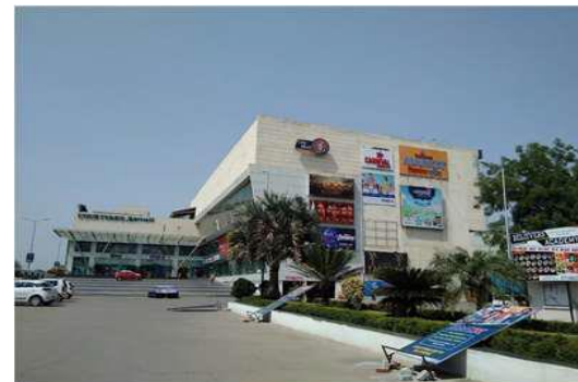
City Mall 36