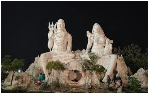
Hemunagar Baal Udayan