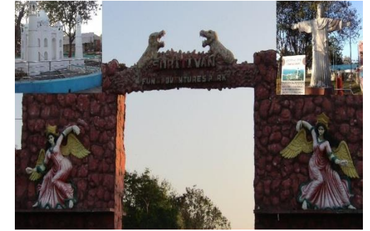
Smriti Adventure Park