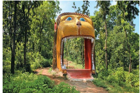
Barnawapara Wildlife Sanctuary