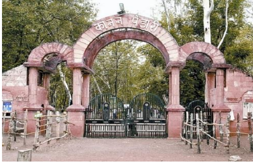
Kanan Pendari Zoo