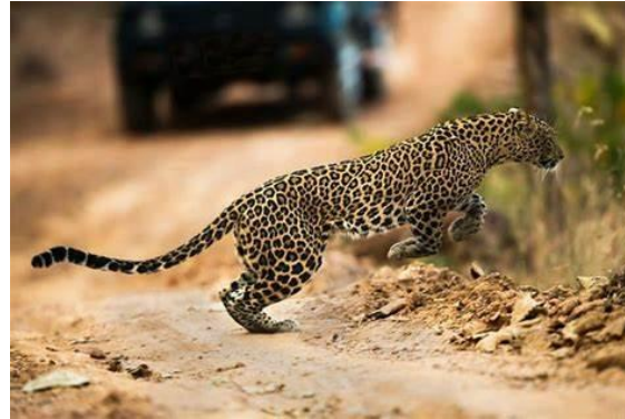
Achanakmar Wildlife Sanctuary